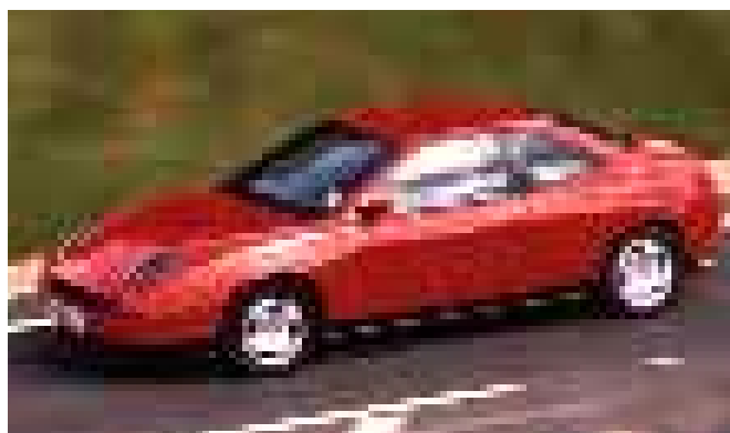
FIAT COUPE 16v